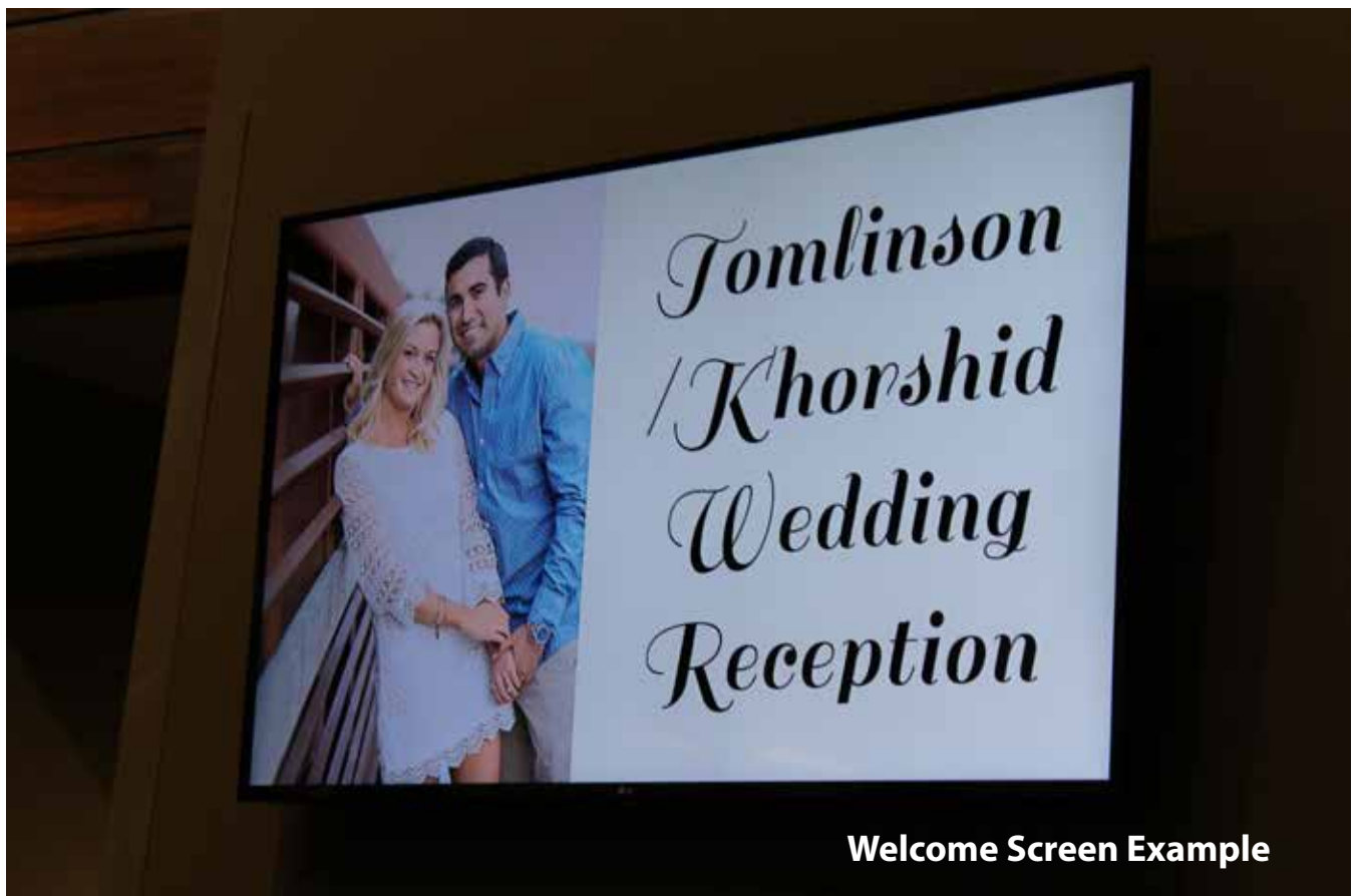
Welcome Screen Example

This screen will be the first thing guests will see as they enter the space your event is being held in. This size is ONLY FOR MEETING ROOM EVENTS. Meeting rooms include Century Club Room, Appleseed A & B, Archer Room A & B and the Red Room. Please ignore if this does not apply to your event.